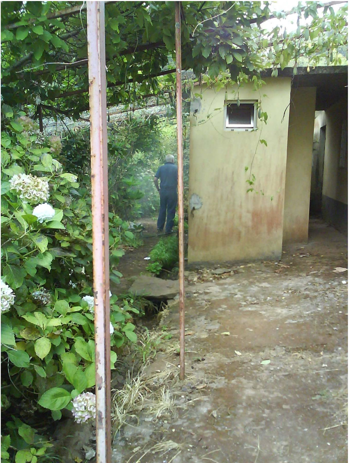
A quick walk down the side to see what this block actually comprises of.