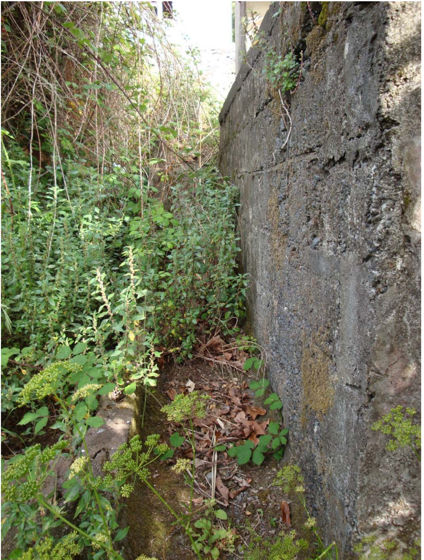
Up the side of the block ... the water tank!