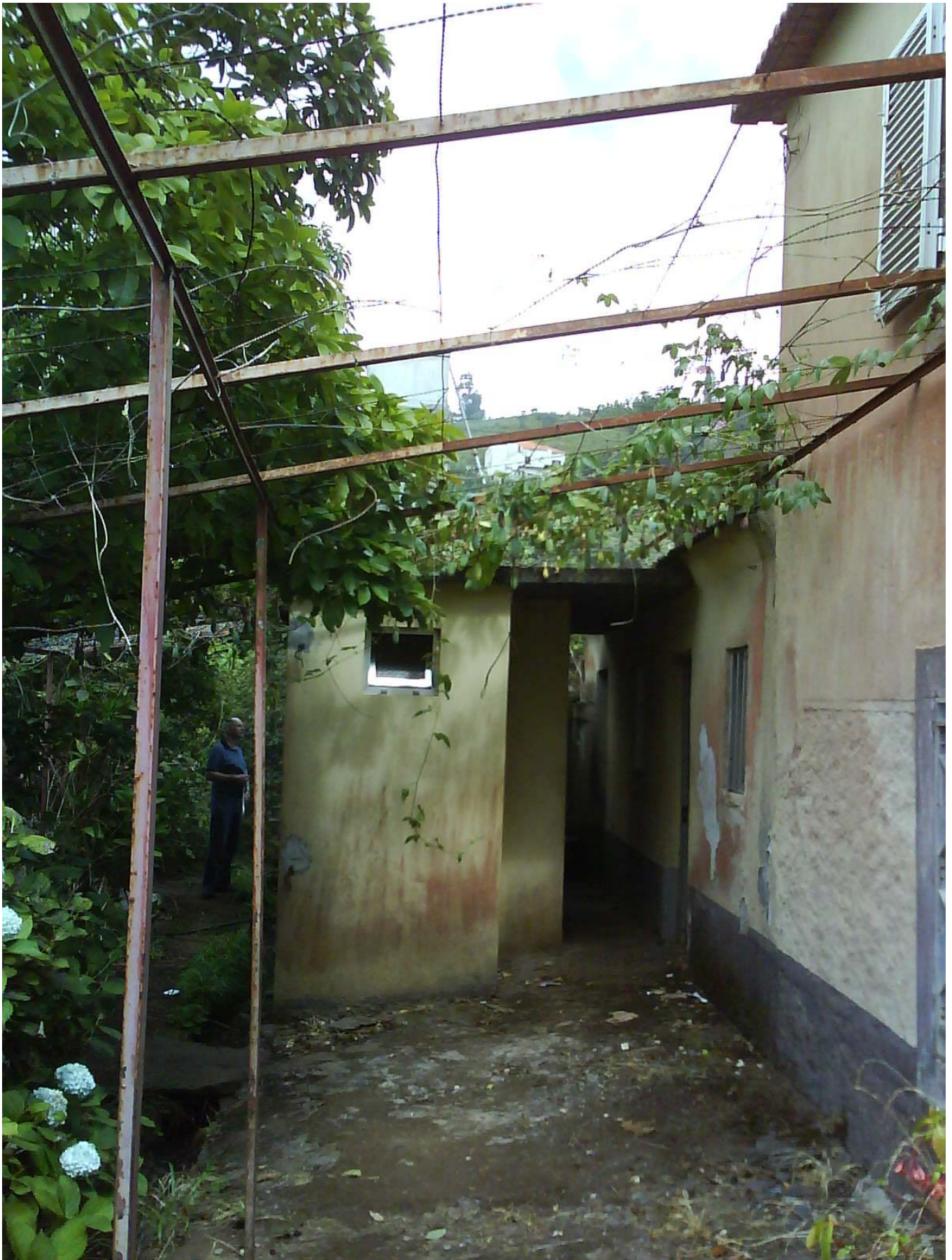
This block comprised of the old toilet, shower, water tanks, and clothes washing area.