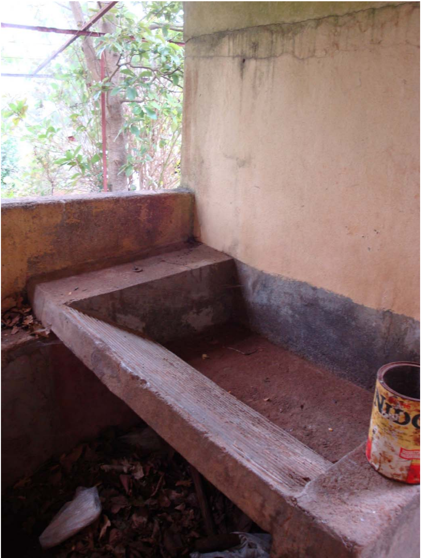
Between the shower/toilet room and the water tank was a washing area with an old fashioned clothes washing basin.